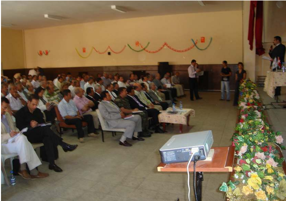
Figure 7-1. Stakeholder Meeting.

The meeting was held at the Industrial Profession High School (“Endustri Meslek Lisesi”) in Bahce on June 19, 2008 (see Figure 7-1). The DEVELOPER circulated invitations via direct invitation letters to direct stakeholders from national, regional and local levels with a project summary attached, via three regional newspapers (“Bahce Gundemi” and “Bahcenin Sesi” on June 16, 2008 and “Haber Gazete” on June 19, 2008) and via poster announcements in the surrounding villages.